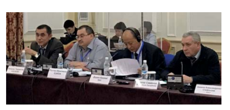
Regional consultations on ICT for agricultural research and extension in CAC region

On December 7-9, 2016, in Bishkek, Kyrgyz Republic a number of Regional consultations on ICT for agricultural research and Extension were conducted by the Association of Agricultural Research Organizations in Central Asia and the Caucasus (CACAARI) in collaboration with the Regional Bureau FAO for Europe and Central Asia (FAO-REU) and with support of the Ministry of Agriculture, Food and Land Reclamation of the Kyrgyz Republic, the Central Asia and the Caucasus Forum for Rural Advisory Services, the Global Forum for Rural Advisory Services, the International Center for Agricultural Research in the Dry Areas (ICARDA) and Kyrgyz Public Foundation «Center training, advice and information». Totally 28 participants from Armenia. Azerbaijan, Georgia, Kazakhstan, Kyrgyz Republic, Tajikistan, Turkmenistan and Uzbekistan, representing various stakeholders of e-agriculture, namely, agricultural research, extension services, agricultural universities, farmers' associations, Ministries of Agriculture, and ICT management at the ministries of agriculture, non-governmental organizations, development agencies, social networks and youth organization took part in these events. The goal of these consultations was to enhance the capacity and awareness of the participants on the key aspects of the components and high-level process of e-agriculture development, exchange of experience and knowledge, discussion of impacts and approaches of e-agriculture, etc.