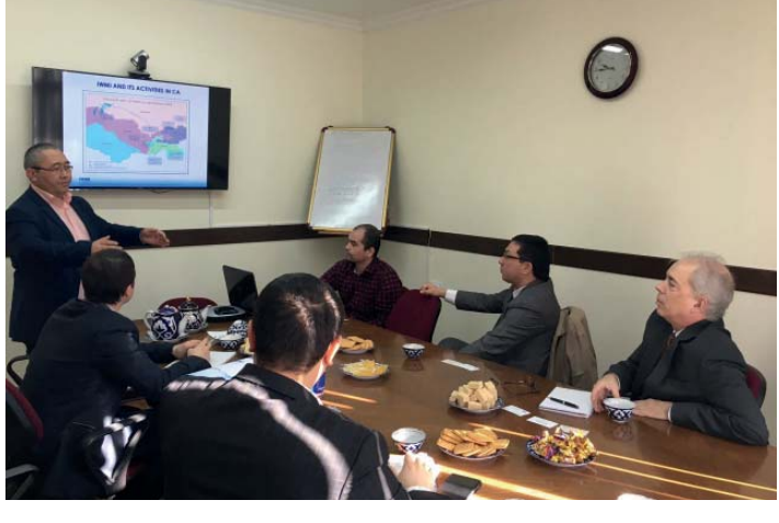
USAID Director for South and Central Asian Affairs visits IWMI-Central Asia office

The International Conference on Economics of Land Degradation in Central Asia was conducted on November 28-29, 2016 in Bishkek, Kyrgyzstan, to discuss the findings and recommendations developed within the regional project on the Economics of Land Degradation (ELD) in Central Asia, initiated in 2014 jointly by the UNCCD, the International Center for Agricultural Research in the Dry Areas (ICARDA) and the GIZ Regional Programme for Sustainable and Climate Sensitive Land Use for Economic Development in Central Asia. The overarching objective of the conference was to consider the FLD results in relation to on-going plans and frameworks to achieve greater synergies between the commitments of the Central Asian countries to the UN environmental conventions (combating desertification, climate change, and biodiversity). The main message of the project is that sustainable land management (SLM) practices, assessed in the different ELD studies, can contribute to livelihood enhancement and more sustainable production systems given a better enabling environment that includes policies and new institutional arrangements